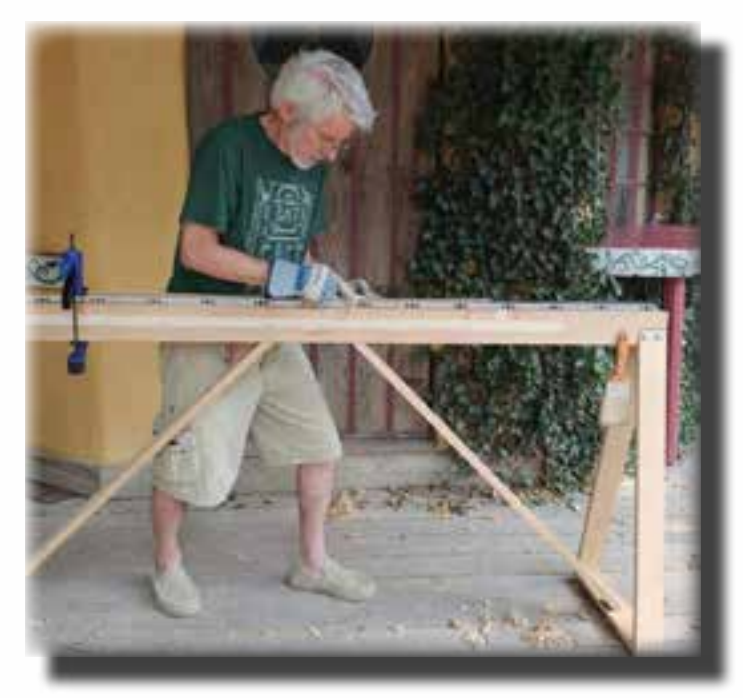
also a time and place to use a rod that is relaxing, light weight, with a slow action, that presents a tiny dry fly ever so softly on still water. Truly a beautiful way to fly fish.

So why choose a bamboo rod to fish with? There are so many choices for the fly fishing angler, to chose from. But there is no other rod choice that has as much history and elegance than fishing with a bamboo rod. Bamboo rods were first crafted and used in the early 1800's in England, and were the rod of choice up till the 1950's, when manufacturers starting producing rods out of new materials. Which leads us to where we are today, with more choices, and technology than ever before. However, these times are changing, as many anglers are going back to using bamboo, for many reasons. The history, tradition, and simplicity are bringing anglers back. Yes, it's great to use fast action rods, slapping streamers to bring on vicious strikes! Who wouldn't like that? But there is