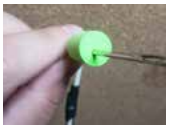
3. Tie in your Estaz Chenille directly on top of where you ended the rabbit.

5. Palmer up the chenille in touching wraps, forward, until you reach where you left the thread wraps. Tie off the Chenille here and snip the tag end off.